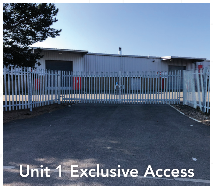
Unit 1 Exclusive Access