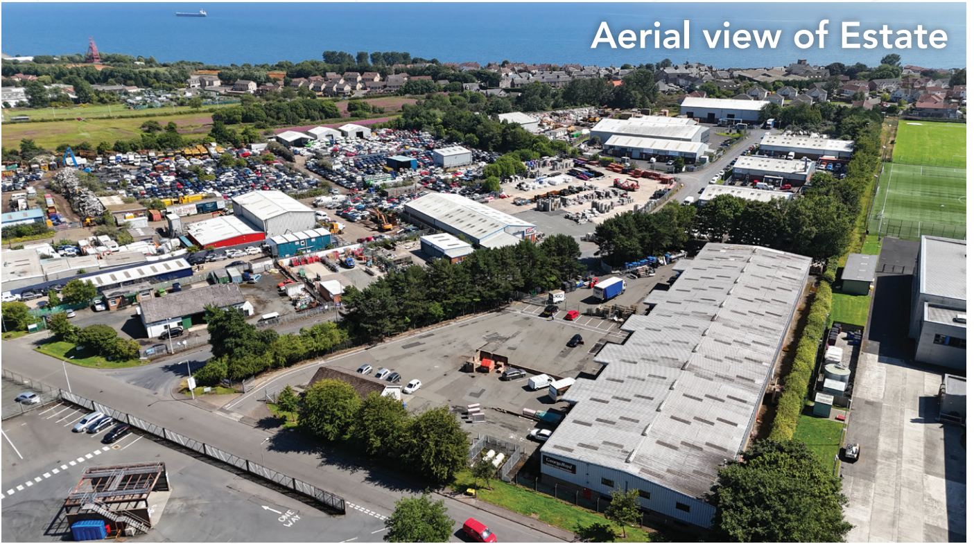
Aerial view of Estate