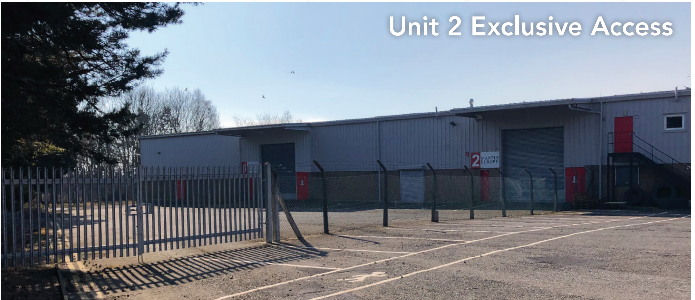
Unit 2 Exclusive Access